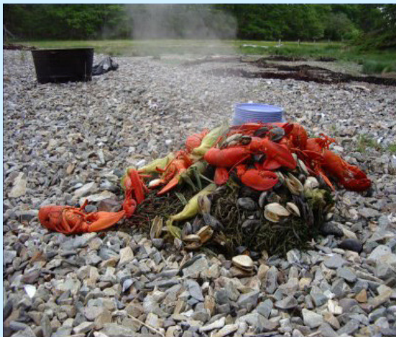
LOBSTER BAKE ON THE BEACH