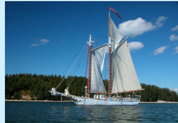
ISAAC H. EVANS

DEADLINE TO SIGN UP IS NOVEMBER 30TH 2015!